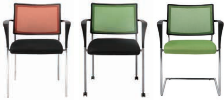
Meeting & Training Chair